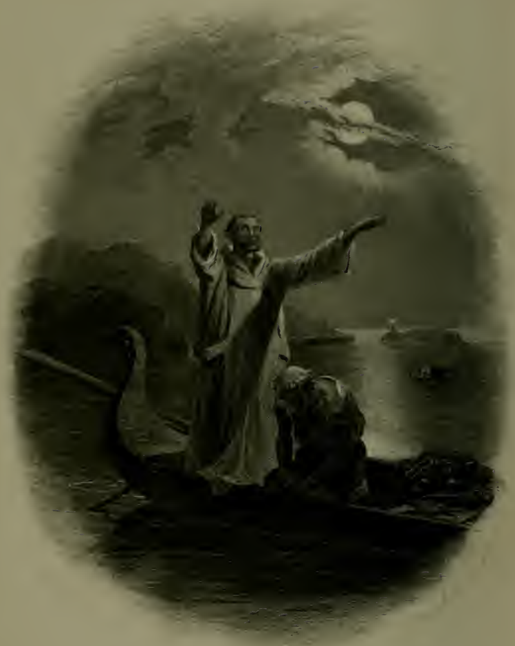
THE BAPTIST MINISTER BY THE SEA